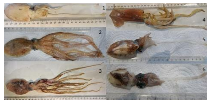
Figure 2. Species of deep-sea cephalopods from NE Mediterranean Sea ( R. macrosoma 1 , B. sponsalis 2 , S. unicolor 3 , T. sagittatus 4 , S. orbignyana 5 , S. elegans 6 )