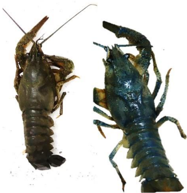
Figure 3. Comparison of normal crayfish and the blue colored crayfish from Atikhisar Reservoir, Çanakkale, Turkey (both individuals are female)

Kale et al. (2020) reported the presence of albinism in crayfish ( P. leptodactylus ) collected from Atikhisar Reservoir in Çanakkale, Turkey, the same location with the present paper, and the authors noted that albinism is a syndrome that occurs in the lack of melanin. In addition, the authors clearly indicated that there were no further reason as causative agents in the sampling location. As previously noted by Kale et al. (2020), there was no fishing pressure or overexploitation probability of fisheries resources in the reservoir. Then again, any pollution was not observed in the lake surface water of the reservoir during the sampling period. Thus, blue color anomaly is probably occurred due to the genetic mechanism of the specimen and environmental factors are less likely factors that affecting the anomaly for the reported specimens in the present paper. Environmental factors were observed in normal conditions and any extreme weather condition was not recorded during the sampling period.