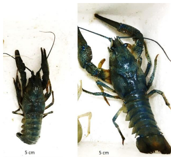
Figure 2. The blue colored mutant crayfish individuals (both female) caught from Atikhisar Reservoir, Çanakkale, Turkey

Both blue colored individuals of crayfish ( Pontastacus leptodactylus ) were female. Blue color anomaly was observed in all parts of the bodies of both individuals.