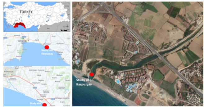
Figure 1. Brackish zone of the sampling area (Karpuzçay Creek Estuary)

The sex determinations of the specimens were evaluated by the dissection method according to the presence of ovaries and testicles. Specimens' sex ratio (F/M) was determined; however, meristic measurements were not taken into consideration. A total of 11 morphometric measurements, 4 from the head area and 7 from the body region were evaluated for the morphometric study. These are total length (TL), standard length (SL), head length (HL), eye diameter (ED), snout length (SNL), head height (HH), predorsal length (PDL), body height (BH), dorsal fin length (DFL), dorsal fin