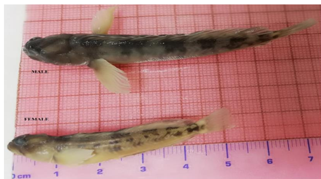
Figure 3. The image of male and female specimens of Salaria fluviatilis (upper: male; lower: female)

The average total length value (TL) in all individuals of the species, which shows the distribution in the Karpuzçay River was determined to be 48.92 \pm 11.92 mm. It was also seen that males had a longer body length than females. There was a statistical difference between the sexes in terms of total height values ( t_{\text{cal}}: -2.139 , p=0.0038 , P<0.05 ). Dorsal fin length (DFL) values had an average of 25.49 \pm 6.70 mm in the whole population and corresponded to 52% of the total length. The dorsal fin length of the sexes was statistically different ( t_{\text{cal}}: -2.206 , p=0.032 , P<0.05 ). These results showed that males had