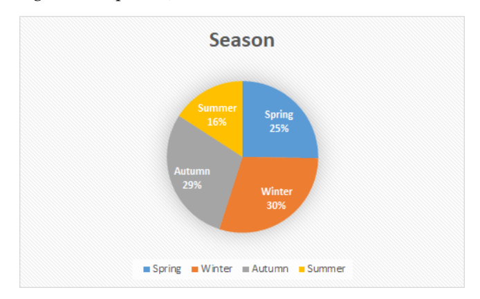
Figure 3. Distribution of seasons fisheries violations in the Mediterranean

(29.12%) violations in autumn, 124 (25.25%) violations in spring and 78 (15.89%) violations in summer. It was determined that the difference in terms of the number of penalties according to the seasons was statistically significant (p<0.05).