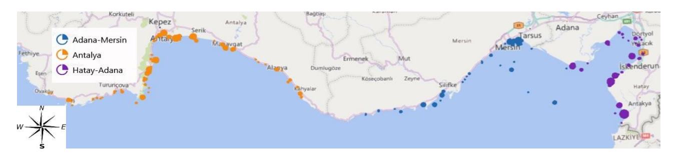
Figure 1. Study area. Circle points show logged penalties with their frequencies (The larger circle, the more penalty records)

The analysis was aimed, by taking into account the frequency and amount of the fines, to extract the patterns of the violations for the fishing gear, region, season, region-season and region-fishing gear-season by region interactions. Although the fines were in Turkish Lira, they have been converted to US dollars at the 2014 exchange rate in order to compare with other studies. Microsoft Excel and Past 4.0.9 software were used for the calculations, statistical analyses (Chi-square goodness of fit test and Chi-square test of independence), and summarization (as tables and graphs). Chi-square tests were performed with 5 % significant level (McHugh, 2013; Connelly, 2019). In case of rejecting the null hypothesis of chi-square test,