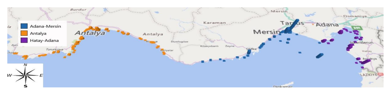
Figure 4. Distribution of penalties totals by region

When the data is examined, it was seen that the highest total penalty amount according to the regions, as a result of illegal fishing activities carried out in the MCS activities, was experienced in the Adana-Mersin region with 49.31%. This is followed by Hatay-Adana region (27.19%) and Antalya region (23.49%).