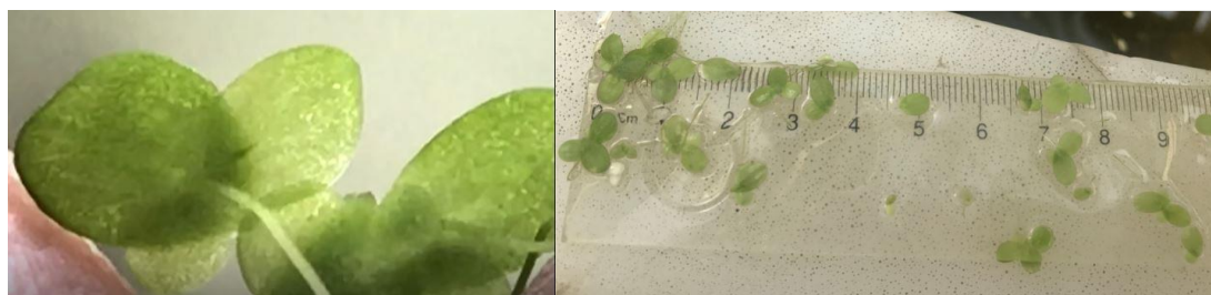
Figure 1. Lemna minor used in the experiment (Original)

The L. minor used in the experiments was obtained from the Aquatic Plant Cultivation Laboratory of Ege University Fisheries Faculty, Urla Research Unit Laboratories.