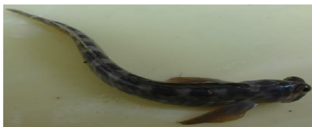
Figure 1. Periophthalmus barbarus from Ibaka Mangrove Swamp (X 25 mag)

Monthly samples of P. barbarus (Figure 1) were obtained at Ibaka mangrove swamp, off Cross River Estuary, Nigeria. A total of 404 samples were collected for six months (from January to June 2022) with the help of the local fishermen who used traditional fishing gears such as cast nets with 10-40 mm as mesh size along with periwinkle baits. The sampling was done using a randomized sampling techniques i.e., collection was done at random using sampling net and traps in the swamp at different points. The samples were transported with the aid of a robust container with lid to the wet laboratory in the Department of Animal Environmental Biology, University of Uyo, Uyo where the biometric data were collected.